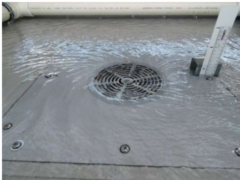
Weir Flow – 2.5 L/s (15mm)