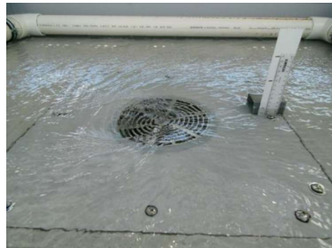
Surcharged flow – 4 L/s (30mm)