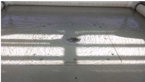
Weir flow – 1 L/s (50mm)