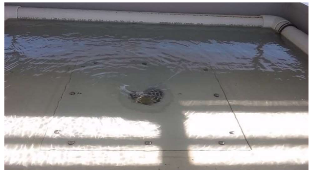
Surcharged Flow - 3.0 L/s (110mm)