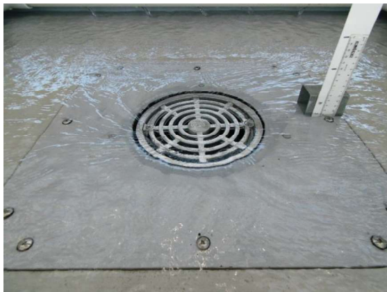
Weir Flow – 1.5 L/s (8mm)