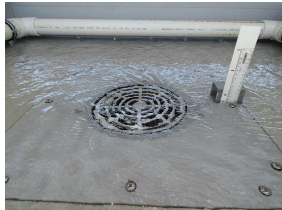
Surcharged Flow – 3 L/s (20mm)