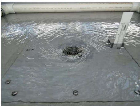
Weir Flow – 2.5 L/s (50mm)