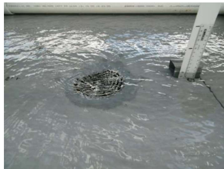
Surcharged flow – 4 L/s (30mm)