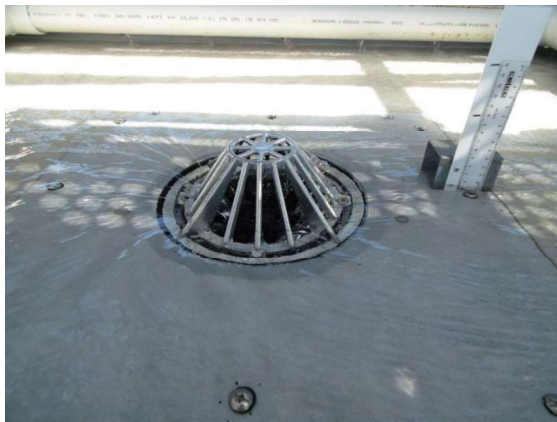
Weir Flow – 3 L/s (12mm)