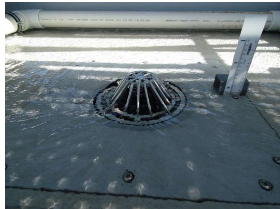
Surcharged flow 5 L/s (30mm)