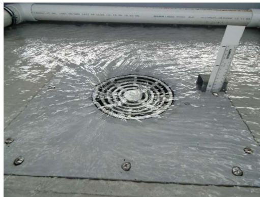
Weir Flow – 7 L/s (30mm)