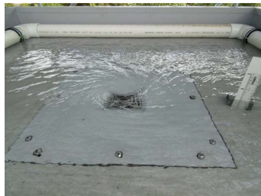
Surcharged flow – 3 L/s (65mm)