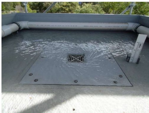
Weir flow - 1 L/s (20mm)