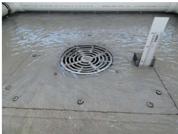
Weir Flow 6.0 L/s (35mm)