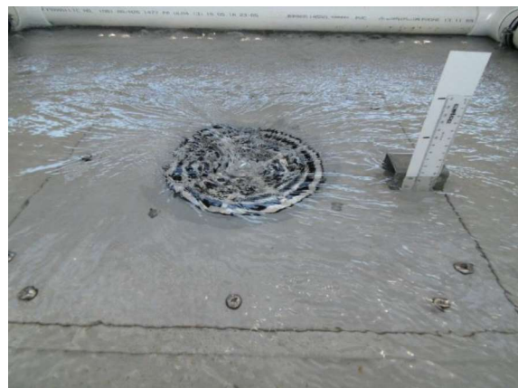
Orifice flow 10 L/s (40mm)