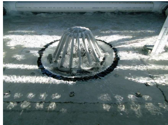
Surcharged Flow - 20 L/s (40mm)