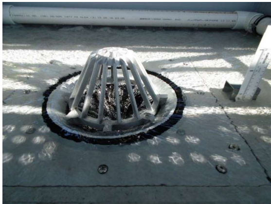
Weir Flow 18 L/s (42mm)