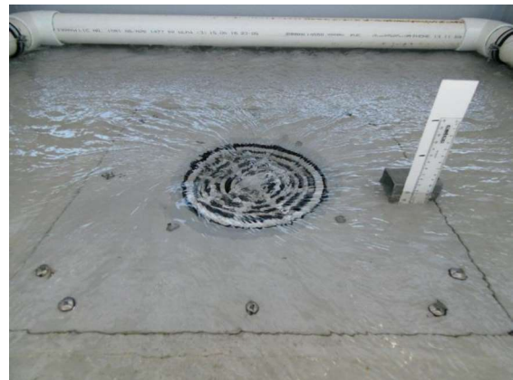
Surcharged Flow 10 L/s (40mm)