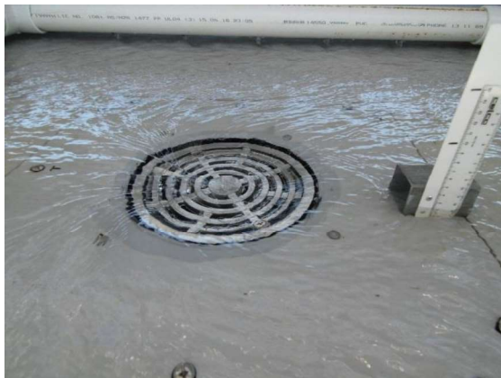
Weir Flow 6 L/s (30mm)