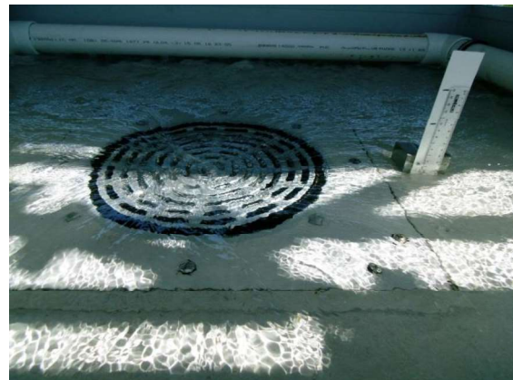
Surcharged Flow 14 L/s (35mm)