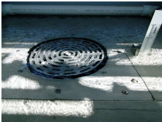
Weir Flow 10.0 L/s (25mm)