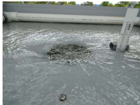
Surcharged Flow – 6 L/s (40mm)