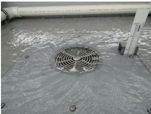
Weir Flow – 2.5 L/s (20mm)