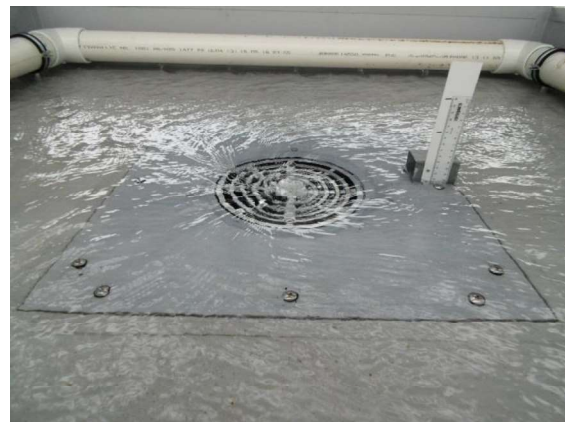
Surcharged flow – 4 L/s (20mm)