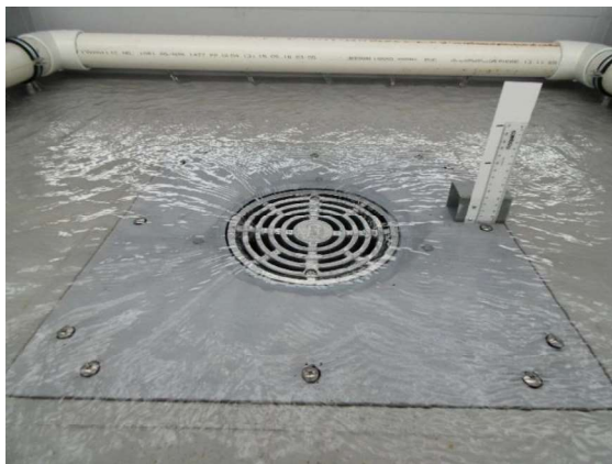
Weir Flow – 3 L/s (15mm)