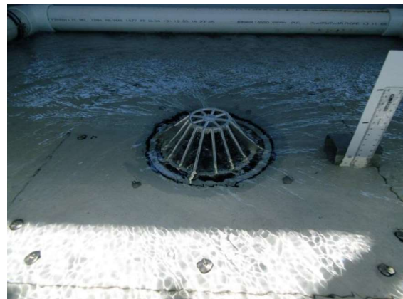
Surcharged Flow – 12 L/s (40mm)