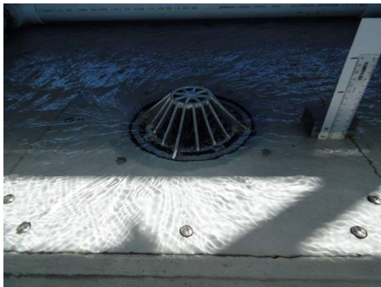
Weir Flow – 8 L/s (30mm)