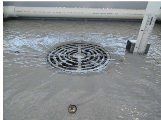
Surcharged Flow – 3 L/s (22mm)