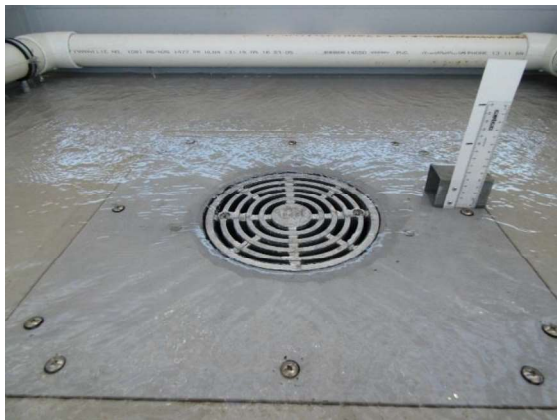
Weir Flow – 1.5 L/s (6mm)