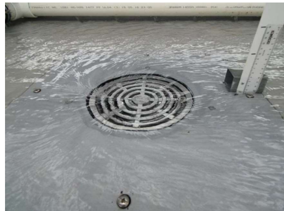
Vortex/surcharged flow 4 L/s (20mm)