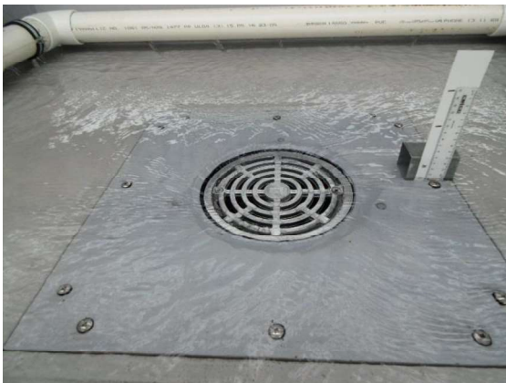
Weir Flow – 3 L/s (13mm)