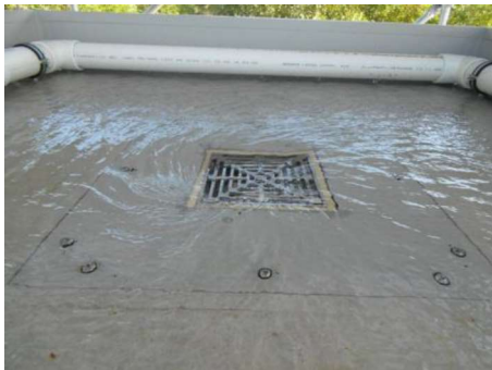
Weir Flow – 4.0 L/s (25 mm)