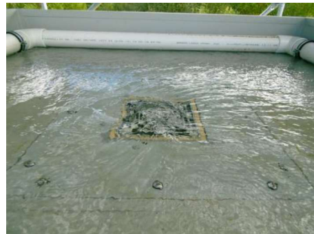
Orifice Flow – 6.0 L/s (36 mm)