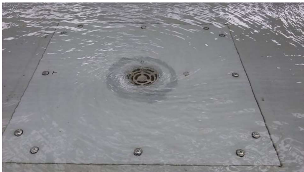
Weir flow - 1.0 L/s (60mm)