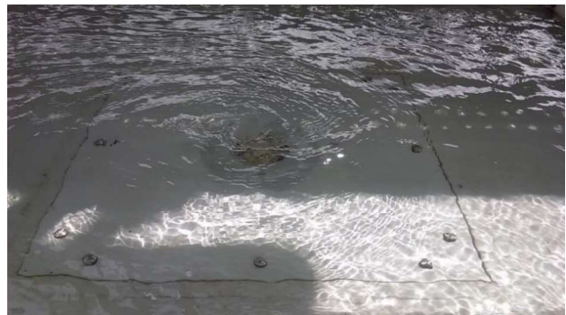
Surcharged Flow - 2.5 L/s (110mm)