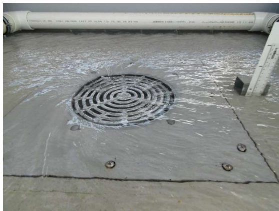
Weir Flow – 7 L/s (25mm)