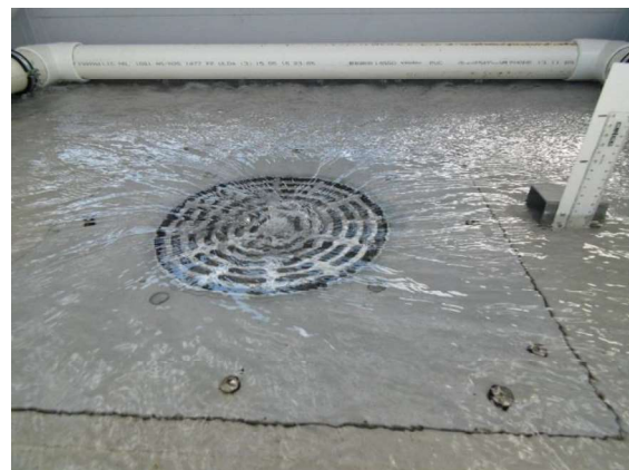
Surcharged Flow – 12 L/s (40mm)