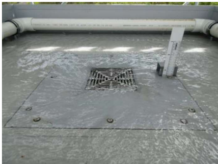
Weir Flow – 2 L/s (20mm)