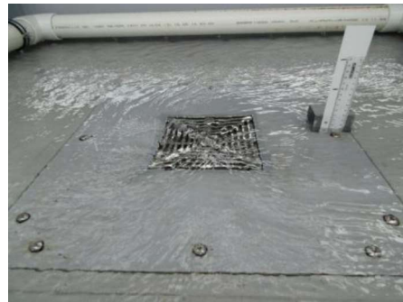
Surcharged Flow 4 L/s (27mm)