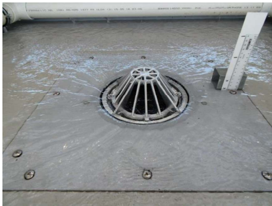
Weir Flow – 1.5 L/s (7mm)