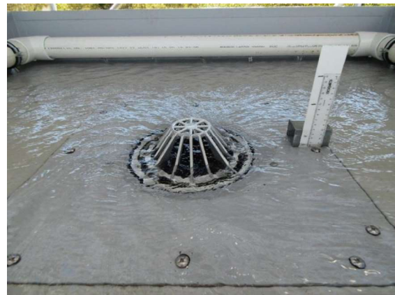
Surcharged Flow 3 L/s (20mm)