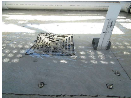
Surcharged Flow – 10 L/s (40mm)