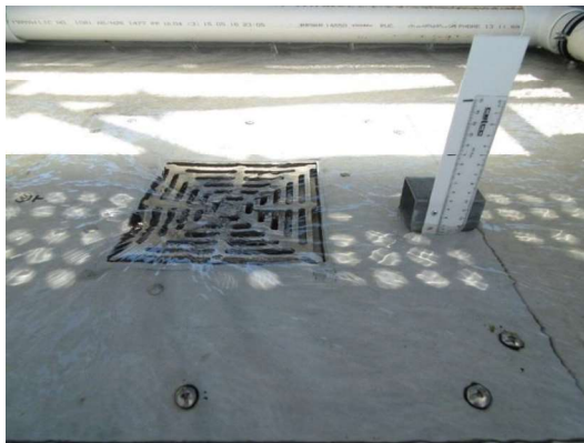
Weir Flow – 6 L/s (18mm)